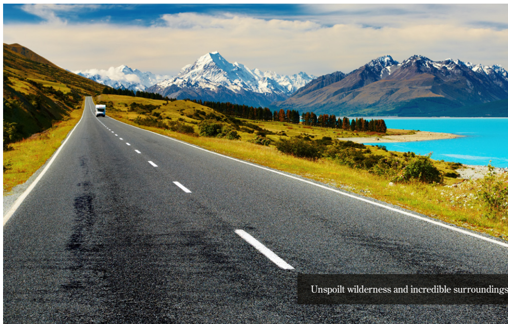
Unspoilt wilderness and incredible surroundings

This morning you will visit Eden Park stadium, the venue of the RWC 2011 Final. After lunch transfer to Hamilton and check in to your accommodation for a two night stay.