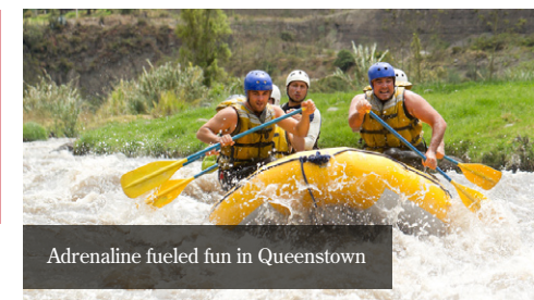
Adrenaline fueled fun in Queenstown

DAY 18 QUEENSTOWN A full day's activity including rafting and Shotover Canyon speed boat trips.