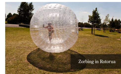
Zorbing in Rotorua

Play your second match against local opposition followed by post match function.