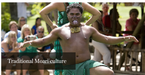
Traditional Maori culture

DAY 10 ROTORUA Transfer to Rainbow Springs, New Zealand's largest and most successful kiwi conservation centre, home to a huge variety of New Zealand's most precious inhabitants including the Kiwi. After lunch explore the Te Puia cultural centre for an informative insight into Maori traditions and heritage.