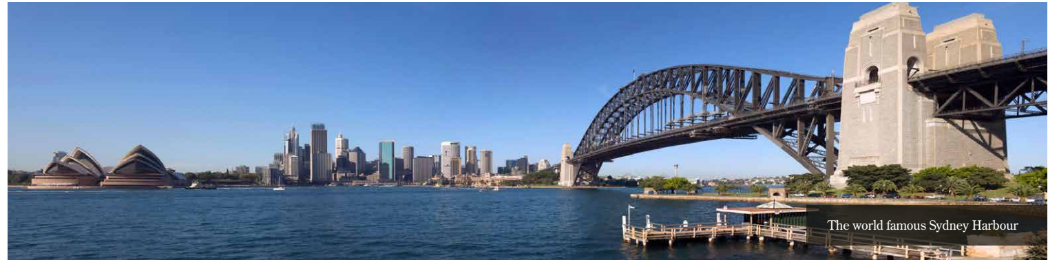
The world famous Sydney Harbour

DAY 2 IN FLIGHT / SYDNEY A quick refuelling stop and depart for Sydney.