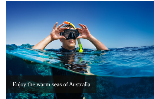
Enjoy the warm seas of Australia

DAY 9 GOLD COAST A full day's excursion visiting the Gold Coast's fantastic theme parks, including Dreamworld and Wet & Wild.